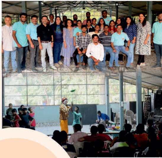
Celebrates festivals with Orphanage Kids