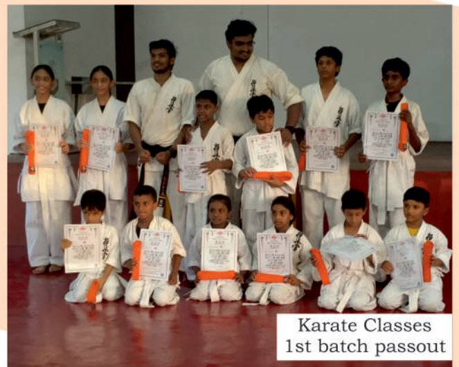
Karate Classes 1st batch passout