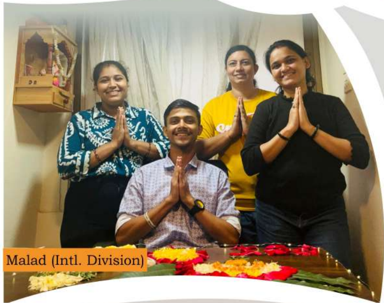
Malad (Intl. Division)