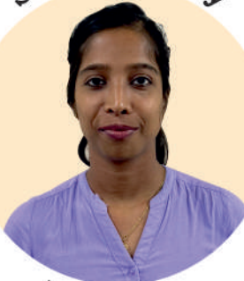
EA to CEO