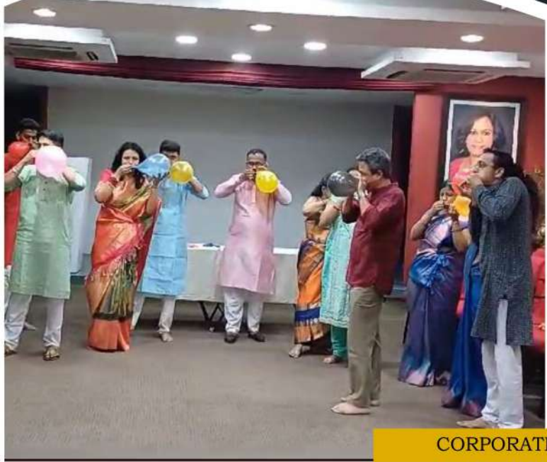
CORPORATE / MUMBAI