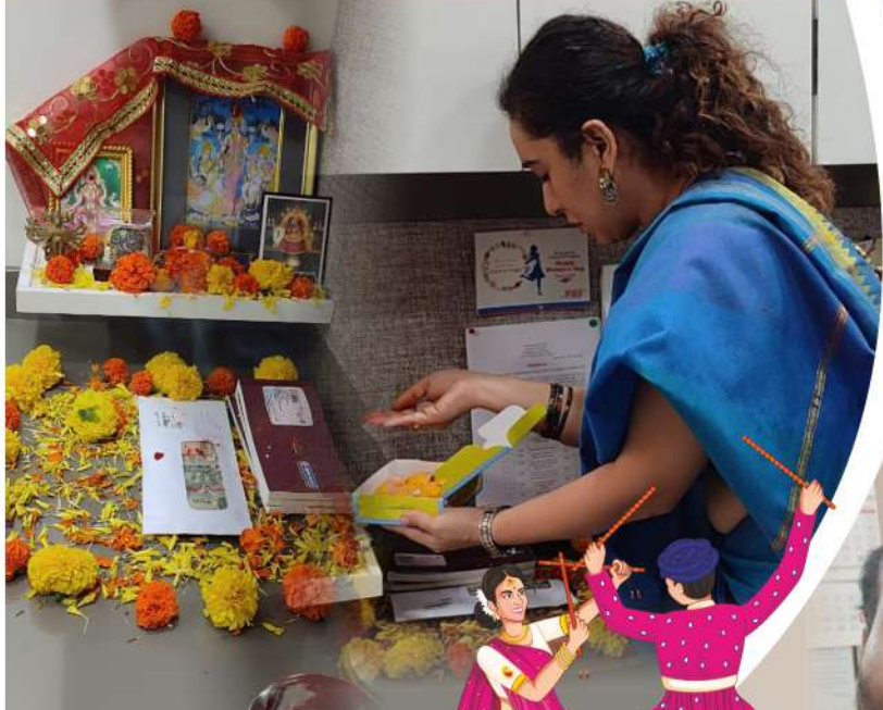
Corporate / Mumbai