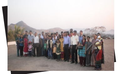
FEI members and their families during the Ashtavinayak darshan.