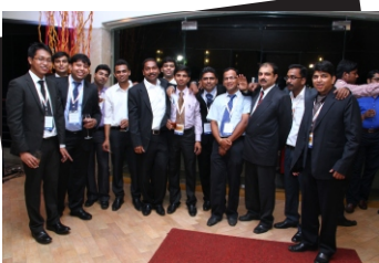
FEI family members suit up for the ICE Awards 2012.