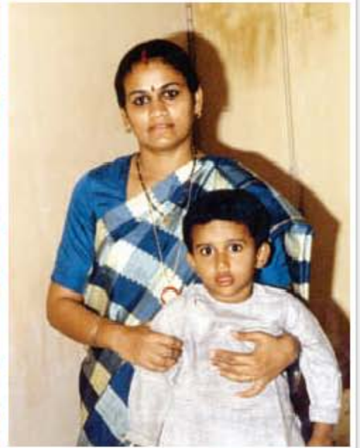
With her purpose of life, her son