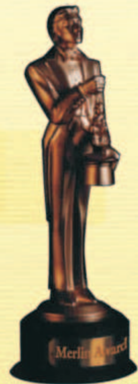
The Merlin Awards