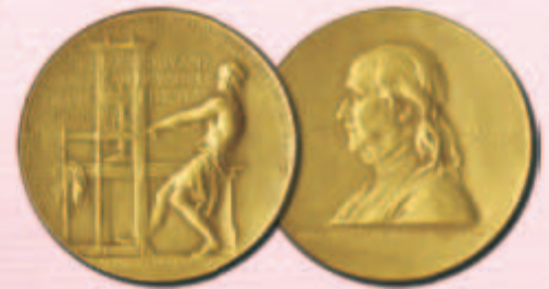
The Pulitzer Prize