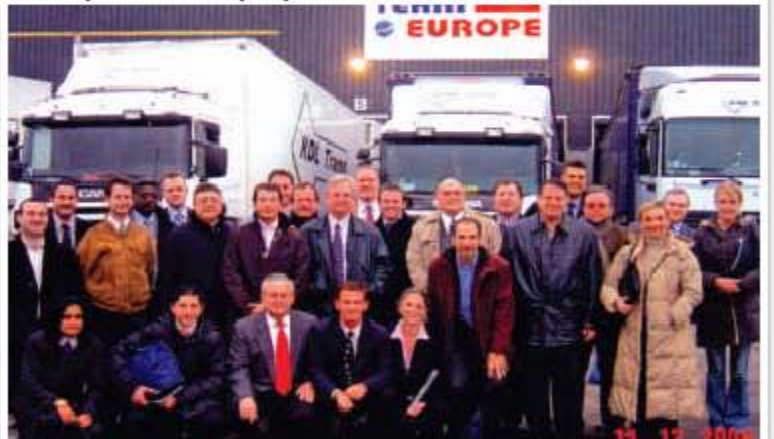
With Team Europe (Now Log Partners) she had a very special relationship with them