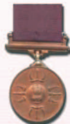
Rajiv Gandhi Khel Ratna