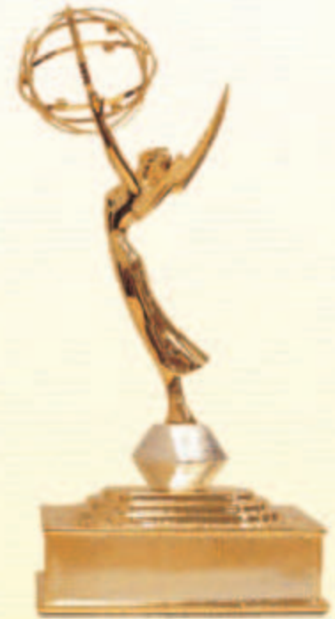
The Emmy Awards