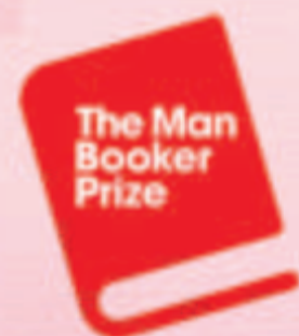
The Man Booker Prize

Some prominent Indian or Indian-origin authors who won include V. S. Naipaul, Salman Rushdie, Arundhati Roy, Kiran Desai, Aravind Adiga.