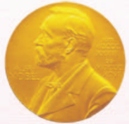
The Nobel Prize

The humorous Ig Nobel Prize is a parody which annually honors research "that cannot or should not be repeated."