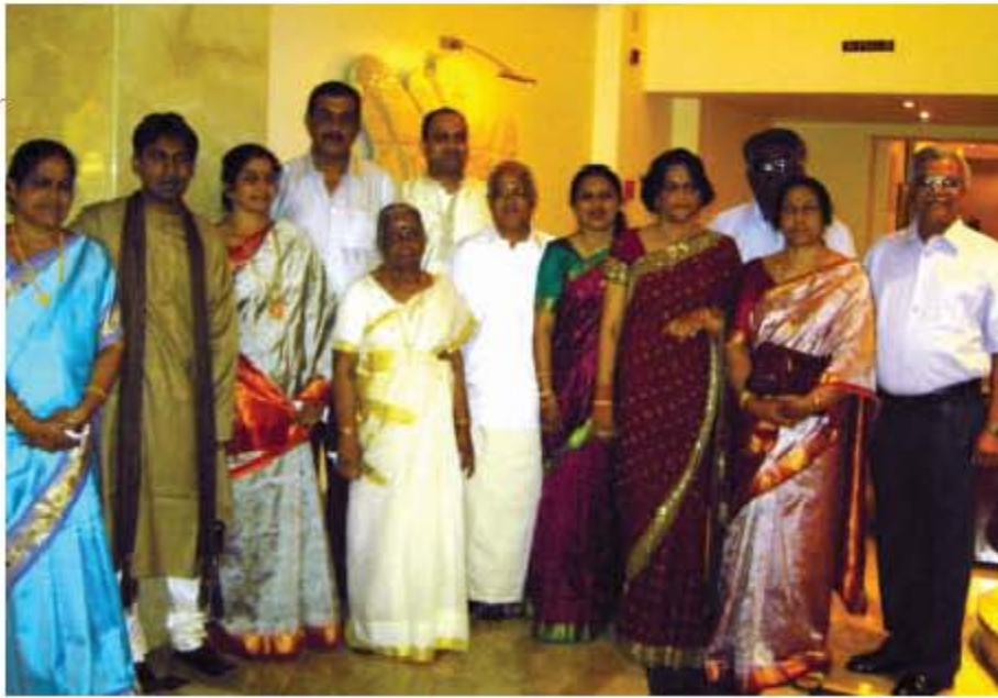
With her beloved family