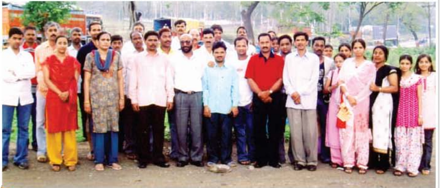
Taken on one of her often repeated Employee Picnics