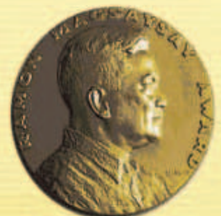
The Ramon Magsaysay Awards

Some prominent Indian winners include Vinoba Bhave, Jayaprakash Narayan, Satyajit Ray, M.S. Subbulakshmi, Ravi Shankar, Kiran Bedi, Pandurang Athavale, Mahasweta Devi, Laxminarayan Ramdas, Arvind Kejriwal.