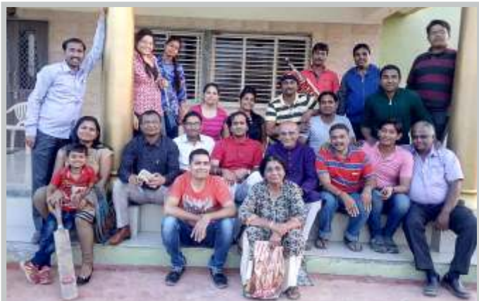
FEI Ahmedabad - Annual picnic to 'Vahelal' on 11th February, 2017.